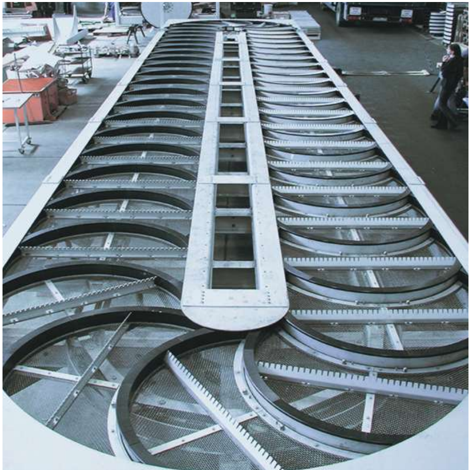
Geiger MultiDisc® during FAT Test at the Manufacturing Site in Germany