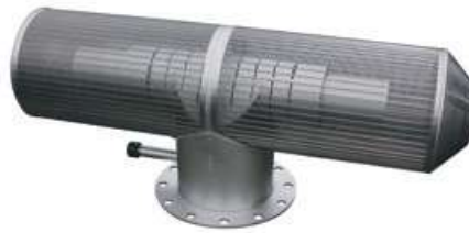
Max-Flow™ Passive Intake Screen

Johnson Screens' next generation Passive Intakes with the Max-Flow™ design increase the flow capacity of the previous designs by up to 40%. The newly redesigned internal modifier allows an even slot velocity distribution also along the extended screening surface in the screen central area. The new