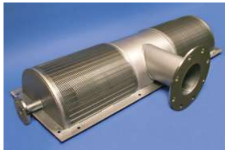
Johnson Screens® Half Intake Screen

As water demands increase for cities, towns and industry, shallow water resources previously hard to withdraw from due to their lack of depth, have become a more viable option.